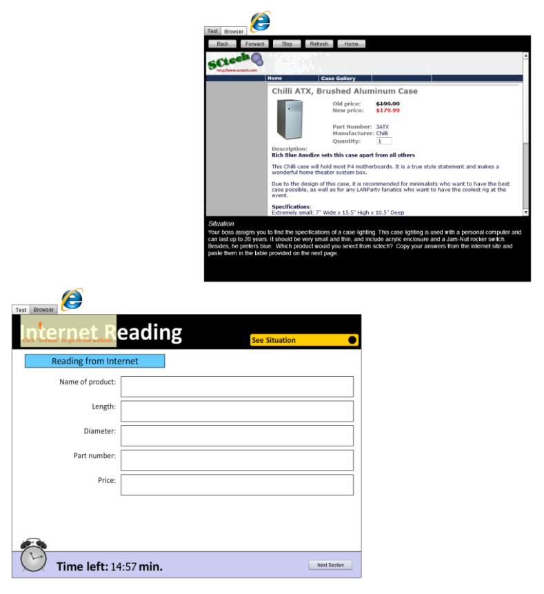
Figure 2: Screenshot of Internet Reading sub-section

right case lighting using some details regarding its specification in relation to conditions/situations indicated on a test page. The test takers can move between the test page and the webpage by clicking on "Test" or "Browser". This part takes approximately 15 minutes to complete (see Figure 2 ).