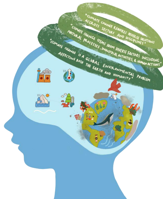
Figure 1 shows three types of perspectives on climate change held by the pre-service English teachers. Firstly, they predominantly viewed climate change as a substantial global environmental challenge affecting both the Earth and humanity. For instance, SS2 stated that climate change had significant adverse impacts on both the Earth and humans, and hence, attempts to address climate change were necessary. SS6 opined that climate change was a global environmental issue primarily caused by human activities, leading to natural disasters.

Climate change has a huge bad impact for the Earth and humans, and we must take any actions to tackle climate change... (SS2, environmental opinion writing, climate change effect )